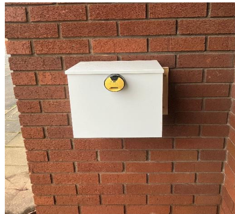
Image 2: Automated sample drop box situated on the wall on the left-hand side of the entrance: