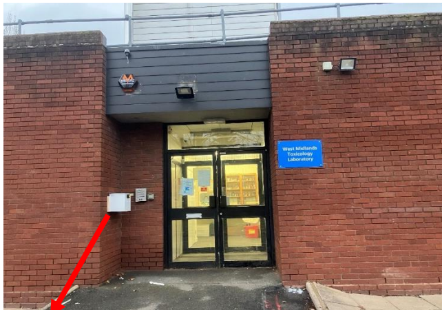
Image 1: Automated Sample drop box situated at Toxicology Laboratory, City Hospital.